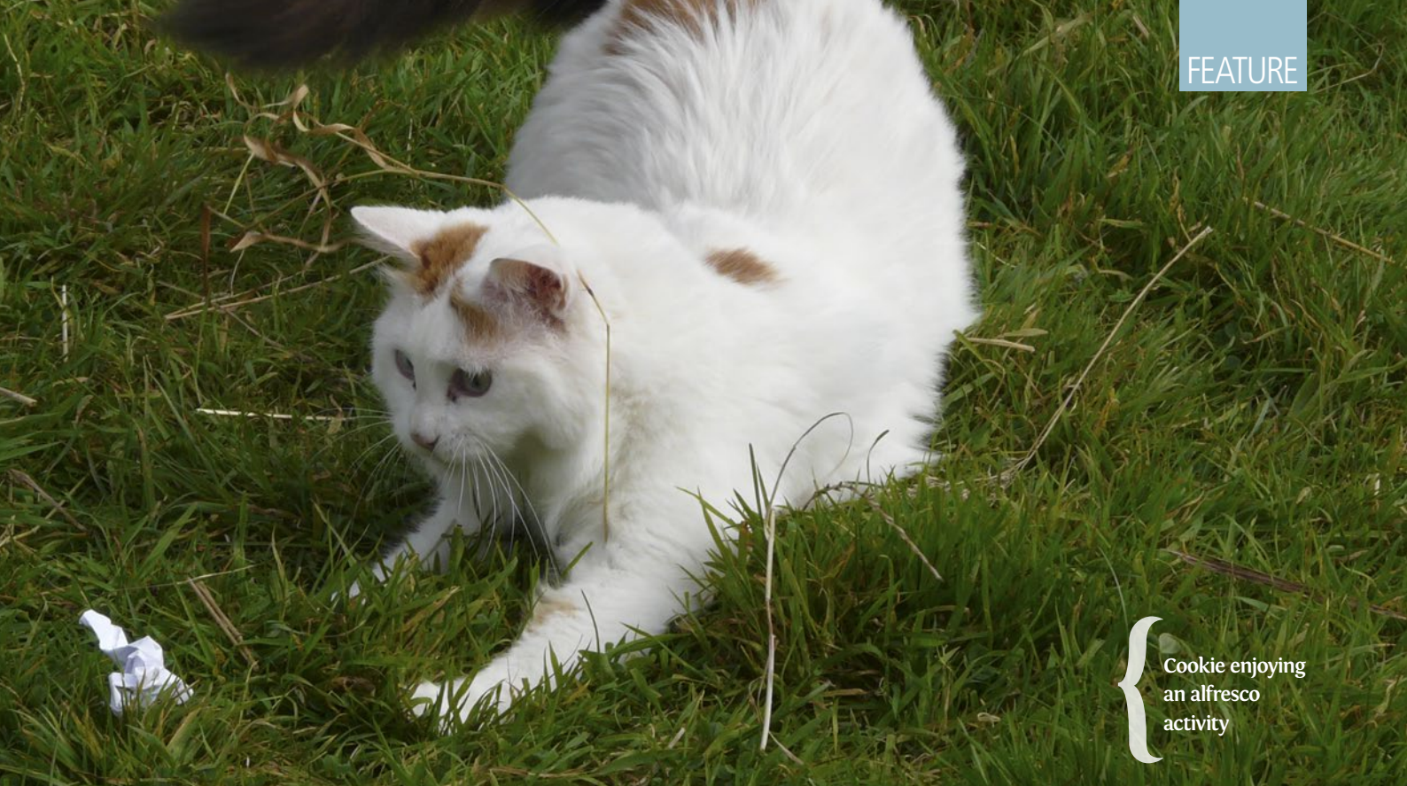
Cookie enjoying an alfresco activity