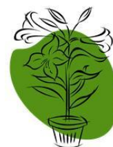
Table Top Sale in Santon Downham - £68.50 Special Event at Dereham and District Adoption Centre - £79.85 Yard Sale - £95 April Craft Sale - £121.85 Plant Sale - £474.98 May Craft Sale - £70.70 June Craft Sale - £63.90 Sainsbury's Collection - £446.38 Sale at Dog Olympics in Filby – 103.74

Since the Tesco Aylsham Collection we have managed to raise some more money for our cats, as listed below. However, some of the figures (the Plant Sale especially) are significantly lower compared with last year. All the funds we raise are spent on helping cats in our local area, so please support us during the upcoming events!