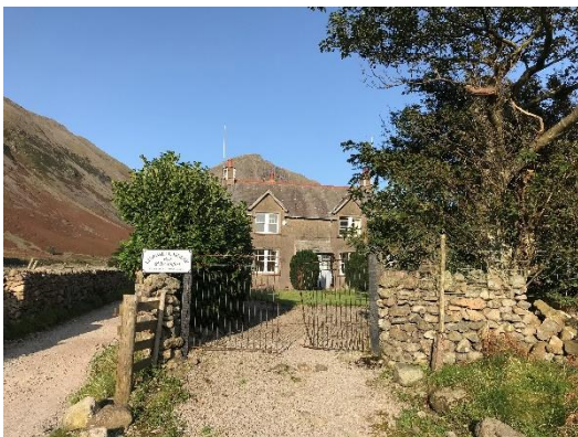
Lingmell House B&B

All the above are located at the head of the valley and close to the start point.